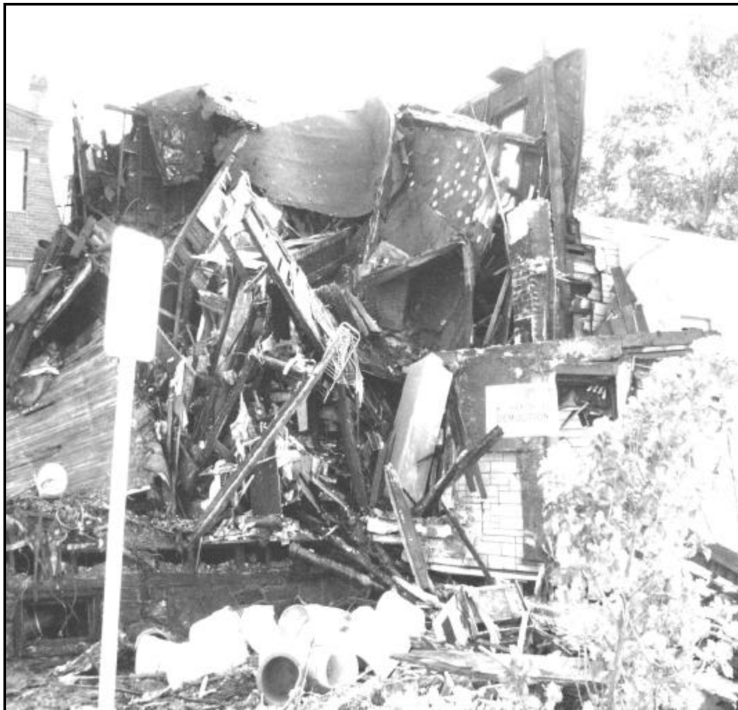
View of collapse from the “A” – “D” corner.

Although the initial rescue area was concentrated at the Division D side of the structure, as additional units arrived with manpower and tools, a second rescue area was established at the Division A side. At some time during the early stages of the rescue operation, the dispatcher switched all units responding into staging to utilize the “Fire 2” radio frequency. This allowed the original “Fire 5” frequency to be reserved for emergency fireground messages only.