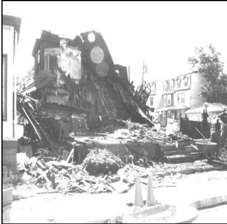
View of collapse from “A” – “B” corner.